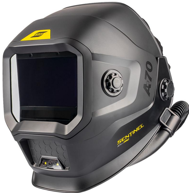
Sentinel A70 Air PRO