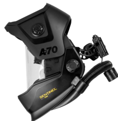
Sentinel A70 Air PRO