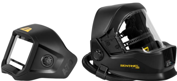
Sentinel A70 Air PRO Removeable ADF