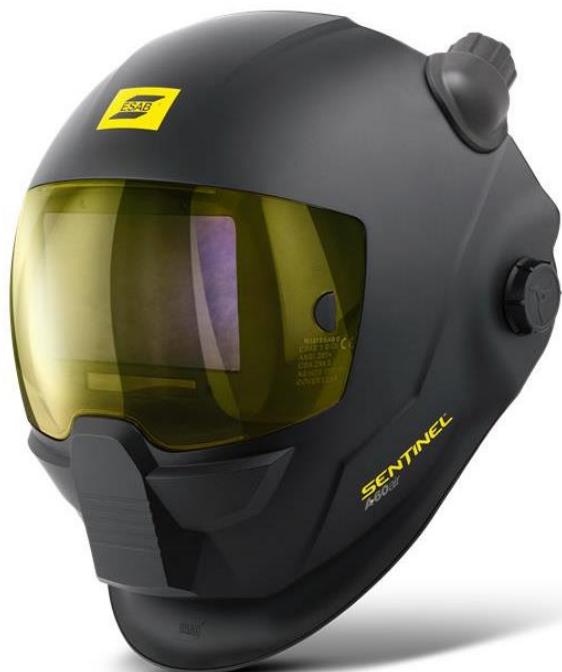
Sentinel A60 Air