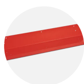
TuffBank Shelf SHE-4