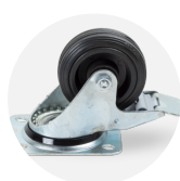
Castor Kit CASS6