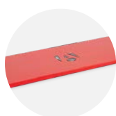
Forma-Stor Shelf FRS2