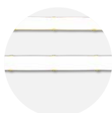
Lighting Kit FRLK-110