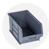
Fittings bins FCB

Disclaimer: all dimensions and weights are approximate